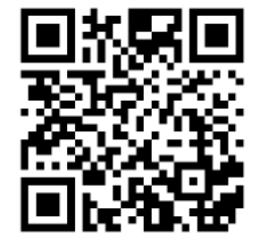
See how our zerorunoff landscaping works at our Mequon store!